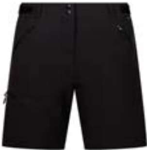
JOCELYN | FABTSHTR0022 • • •

FABRIC PROPERTIES Antibacterial Quick Dry