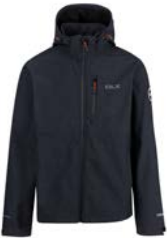
DLX SOFTSHELL DLX MEMBRANE

FABRIC PROPERTIES Waterproof 10000mm Breathable 5000mvp Windproof