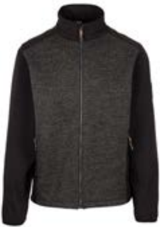
DLX SOFTSHELL DLX MEMBRANE