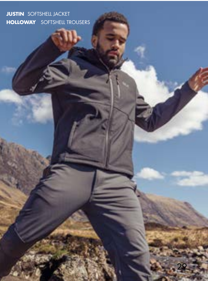
JUSTIN SOFTSHELL JACKET HOLLOWAY SOFTSHELL TROUSERS

FABRIC PROPERTIES Waterproof 10000mm Breathable 5000mvp Windproof