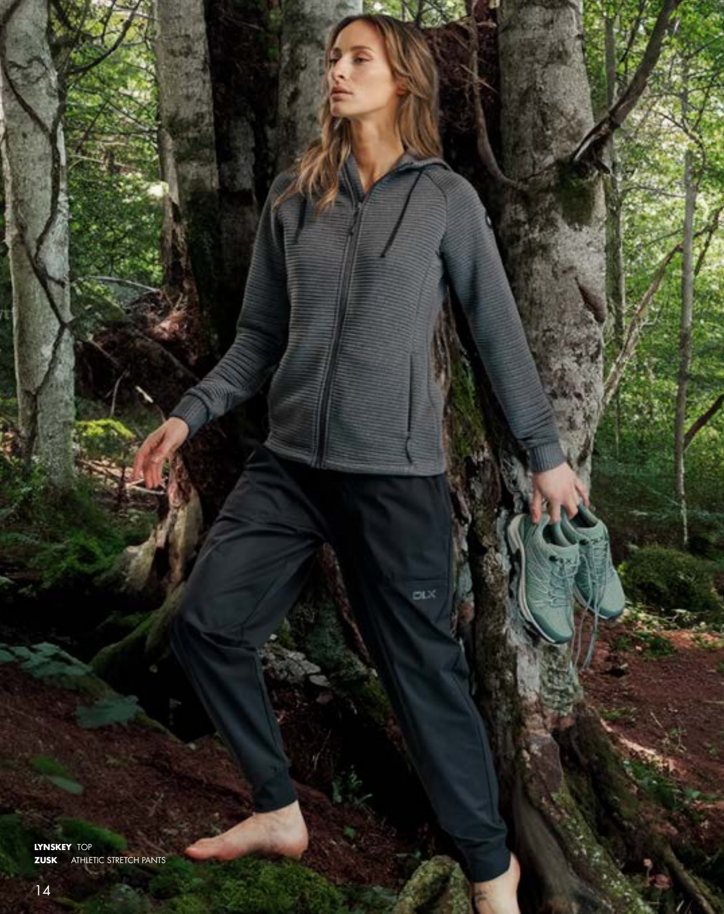
LYNSKEY TOP ZUSK ATHLETIC STRETCH PANTS