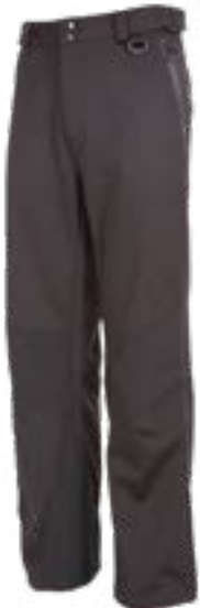
DLX SOFTSHELL DLX MEMBRANE

FABRIC PROPERTIES Waterproof 10000mm Breathable 5000mvp Windproof