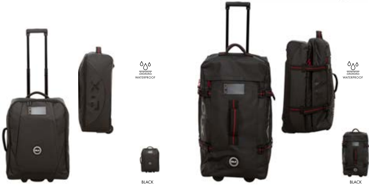
MARTROL 40 | UAACBATR0013

TECHNICAL SPECIFICATION 40L Trolley Bag Carry Handles Top & Side Zipped Main Compartment Zipped Front Pocket Retractable Trolley Handle Address Pocket