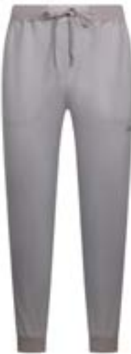
DLX ATHLETIC DLX STRETCH DLX SKIN QUICK DRY

FABRIC COMPOSITION Shell: 100% Polyester Lining: 100% Polyester