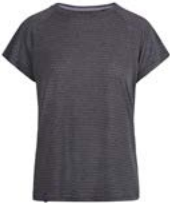
AGATHA | FATOTSTR0059 •

FABRIC PROPERTIES Antibacterial Quick Dry