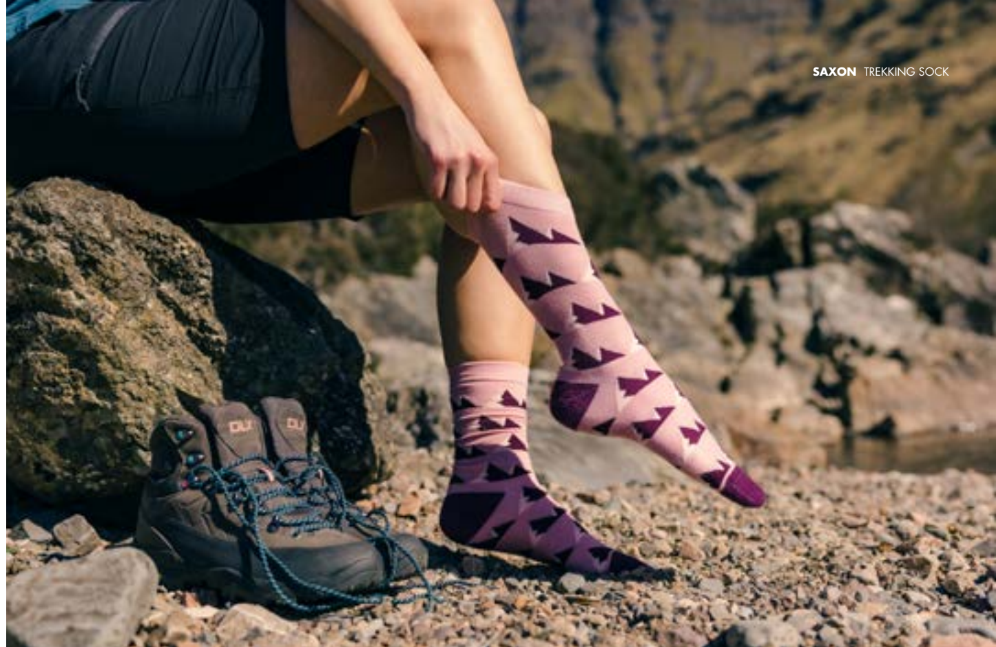
SAXON TREKKING SOCK