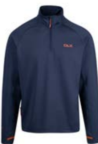
DLX SKIN antibacterial QUICK DRY

FABRIC COMPOSITION 76% Polyester / 17% Rayon / 7% Elastane FABRIC PROPERTIES Quick Dry Wicking