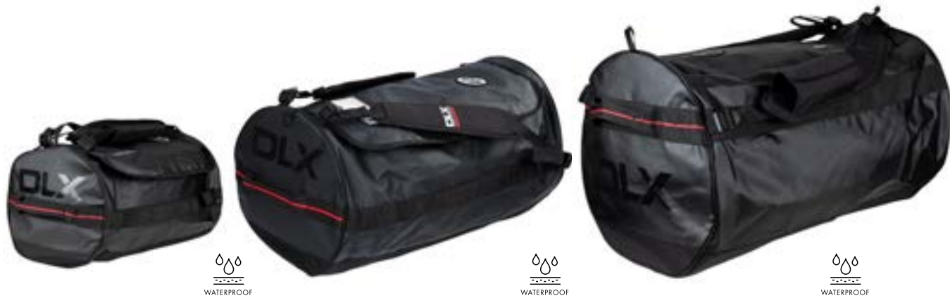
MARNOCK 20 UAACBATR0010

TECHNICAL SPECIFICATION Padded Shoulder Straps Velcro Carry Handle Inside Zipped Pocket Address Label Separate Storage Bag