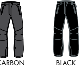
SOLA | FABTTRM20002

TECHNICAL SPECIFICATION Flat Waist with Elastication at Back Front Fly Opening 2 Welded Waterproof Zip Pockets Articulated Knee Darts Reinforced Ankle Patches Elasticated Ankles with Zipped Side Vent