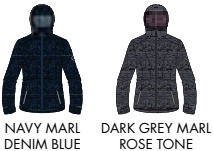
CHRISTINE | FAJSSTRO020

TECHNICAL SPECIFICATION Adjustable Zip-off Hood Water Repellent Centre Front Zip 2 Lower Zipped Pockets with Water Repellent Zips Draw Cord Adjustment at Hem Adjustable Cuff Tab Contrast Brushed Backing Badge Detail on Sleeve