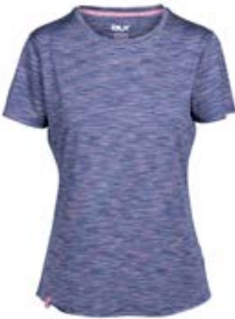
ELKIE | FATOTSTR0027 •

TECHNICAL SPECIFICATION Short Sleeves Round Neck Contrast Inner Neck Tape