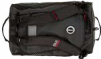
MARNOCK 70 UAACBATR0012