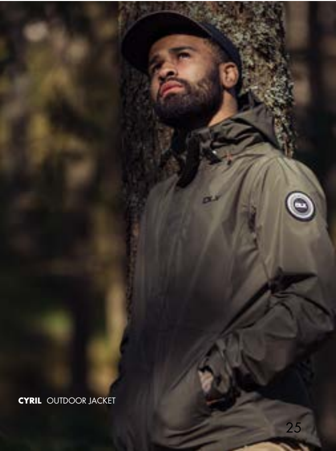
CYRIL OUTDOOR JACKET

FABRIC COMPOSITION Shell: 100% Polyester TPU Membrane Backing: 100% Polyester FABRIC PROPERTIES Waterproof 15000mm Breathable 10000mvp Windproof Taped Seams