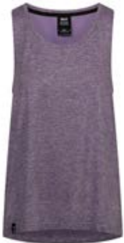
JOANNE | FATOVTTT0013 •

FABRIC PROPERTIES Antibacterial Quick Dry