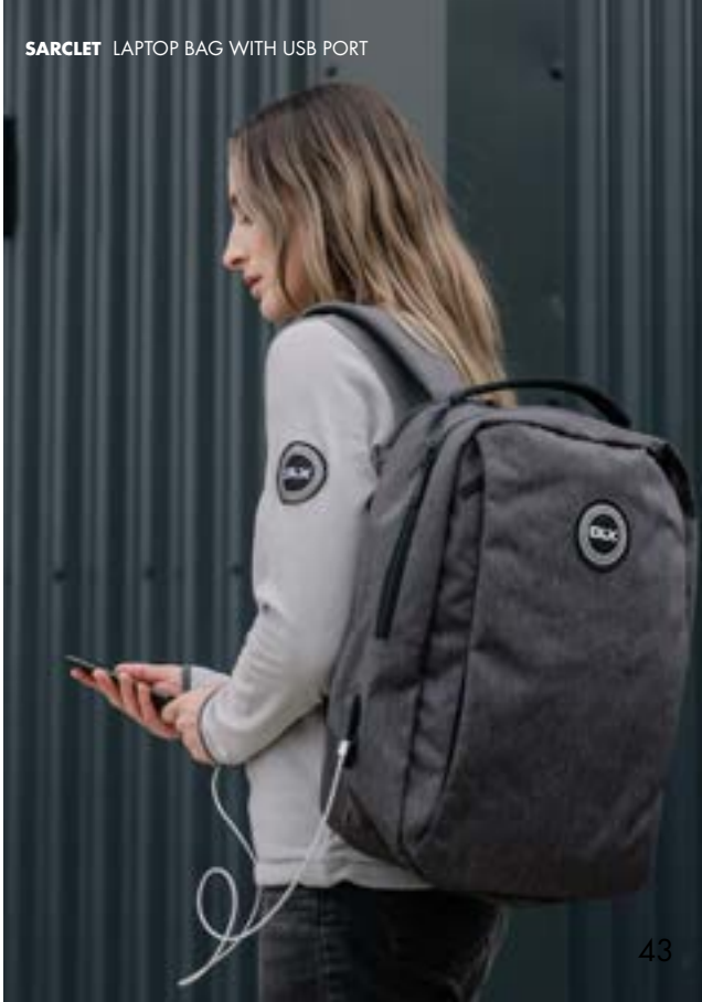
SARCLET LAPTOP BAG WITH USB PORT