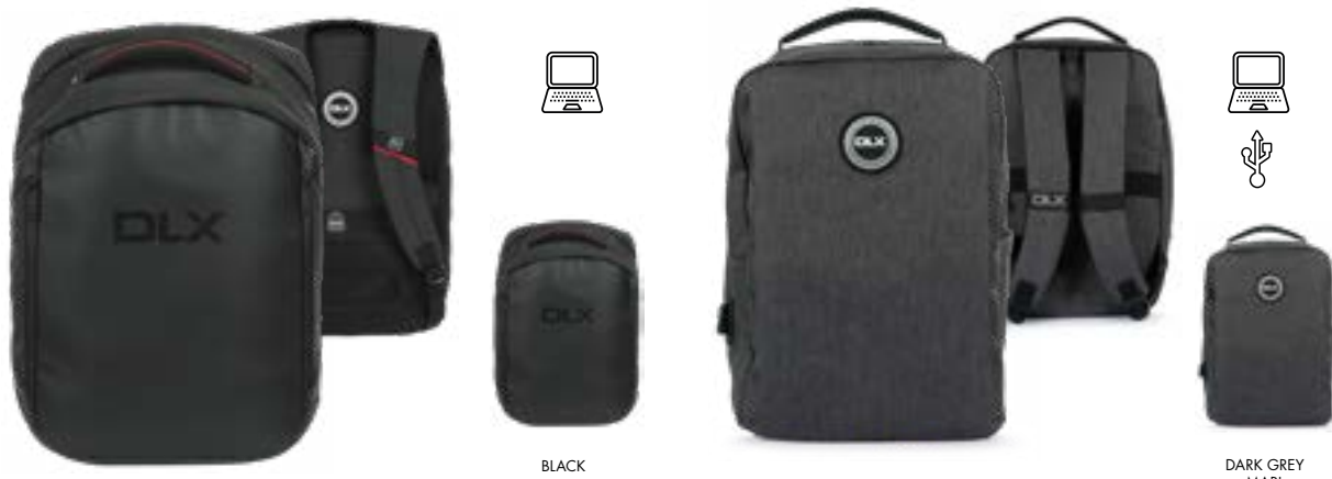
SHIRBURN | UUACBATR0010

FABRIC PROPERTIES Waterproof 10,000mm AVAILABLE IN EACHES