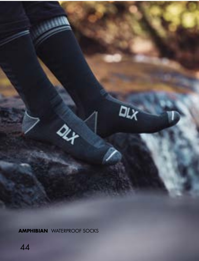
AMPHIBIAN WATERPROOF SOCKS