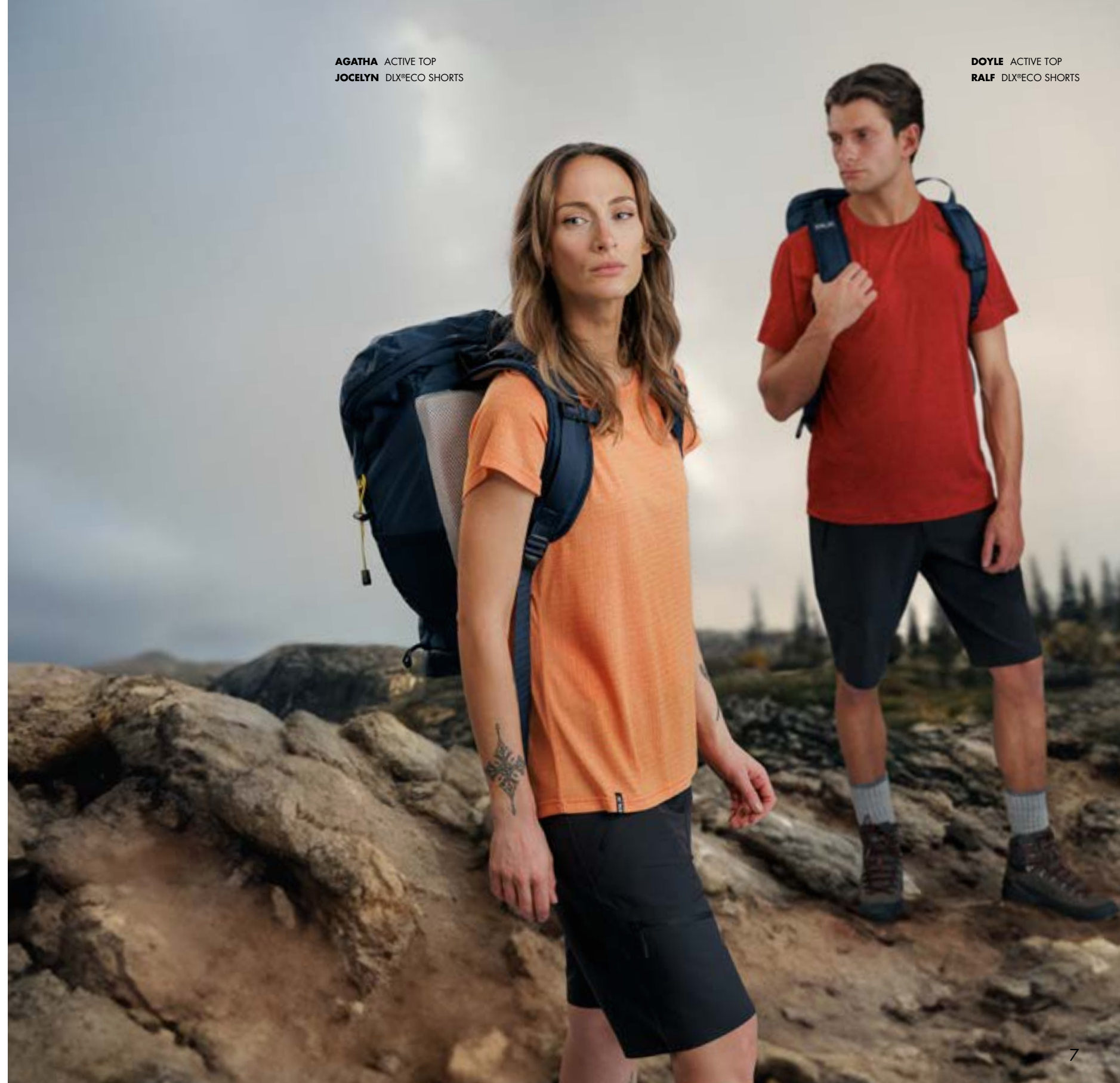
AGATHA ACTIVE TOP JOCELYN DLX®ECO SHORTS

DLX – where innovation meets adventure, and confidence meets performance, catering to the dynamic spirit of those who aspire to go beyond the ordinary. Embrace the journey with gear that not only meets but exceeds expectations, because your outdoor aspirations deserve to be limitless.