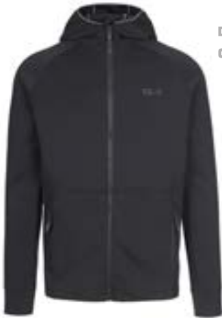
DLX ATHLETIC QUICK DRY