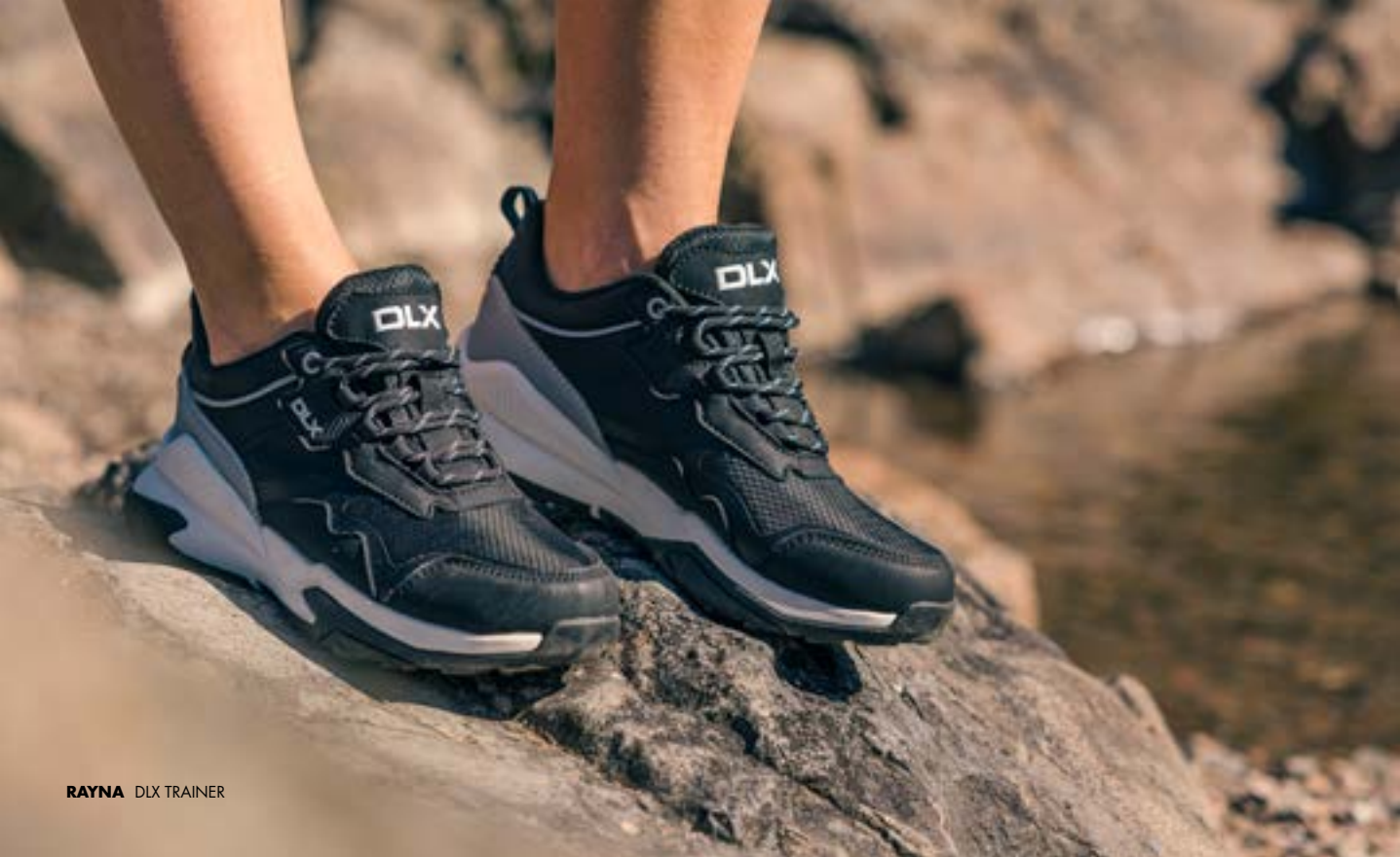
RAYNA DLX TRAINER