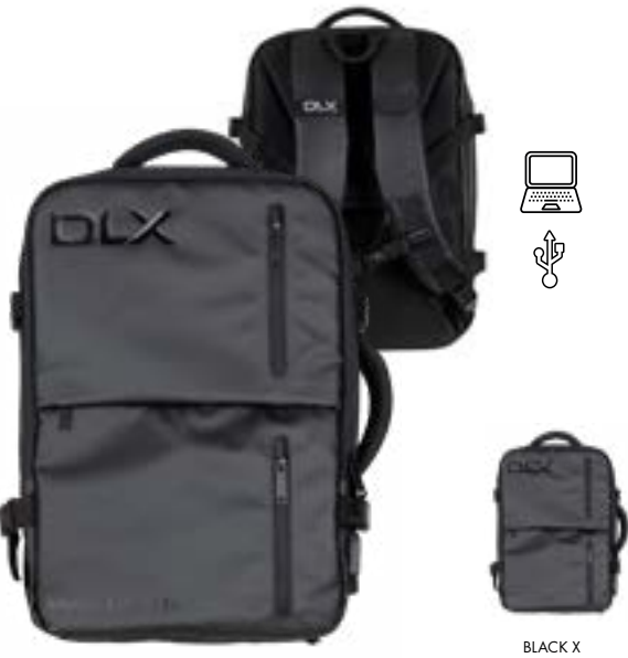
RADOS | UAACBATR0028

FABRIC COMPOSITION Shell: 100% Polyester PU Coating Lining: 100% Polyester PU Coating Filling: 100% Polyethylene AVAILABLE IN EACHES